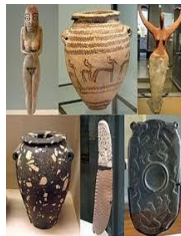
Fig 3 : Art of Ancient Egypt