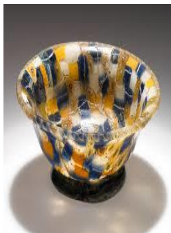
Fig 2: Glass based fine arts