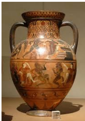
Fig:1 Ceramics based